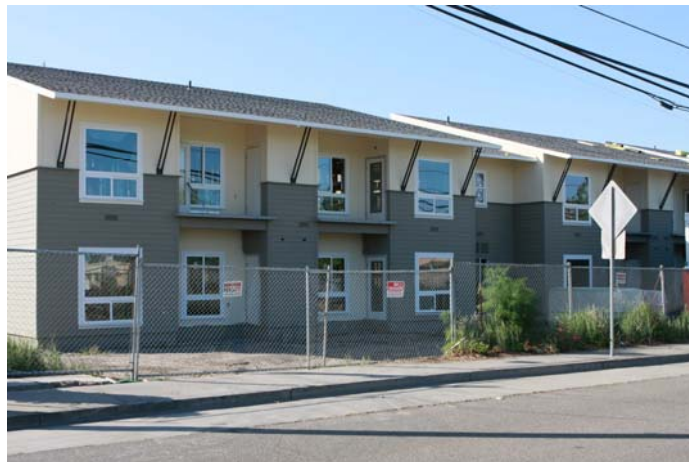
Petaluma's newest affordable senior housing – Casa Grande Senior Apartments Opening in December 2008