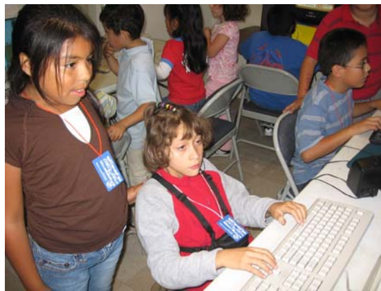
On-Site Boys and Girls Club at Round Walk Village in Petaluma.

Other funds were utilized by the Boys and Girls Club to operate an on-site club at five affordable family housing properties Monday through Friday from 2:00-6:00 and operate programs in: health and life skills; sports, fitness and recreation; character development and leadership development; and education and career development.